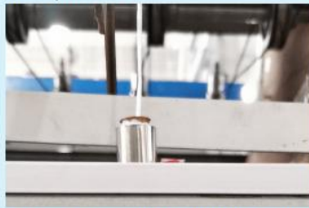
5. Adjust the machine temperature according to the order and ear loop requirement