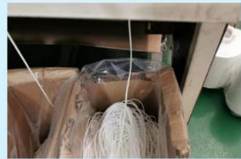
6. The products are packed in bags and put in warehouses