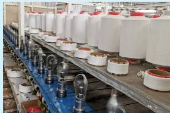
4. Adjust the machine head device