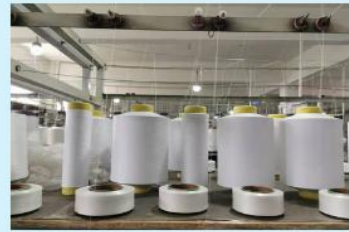
3. Adjust the tension of the clamp