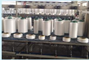
1. Put the polyester yarm on the machine