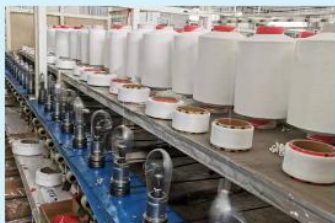
4. Adjust the machine head device