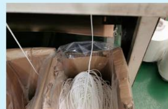
6. The products are packed in bags and put in warehouses