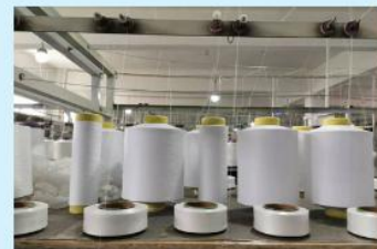
3. Adjust the tension of the clamp