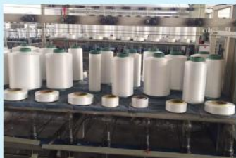
1. Put the polyester yarn on the machine

Ear loop is made of crochet needle without any chemical material in it, the product has characteristics of softness, symmetry and uniformity.