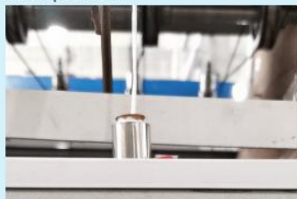
5. Adjust the machine temperature according to the order and ear loop requirement.